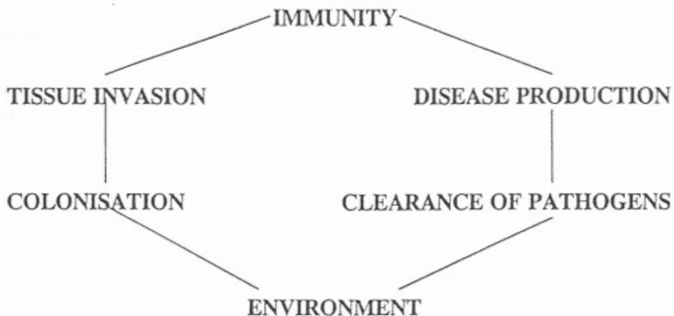
Figure 2: The infection cycle (Tomkins and Watson, 1989)

The terms "disease" and "infection" are often used synonymously, but there are important distinctions between them. Disease is only present when the host displays clinical manifestations of infection and where infection leads to abnormalities of organ function. In addition a certain number of organisms must be present before an infection can be termed disease.