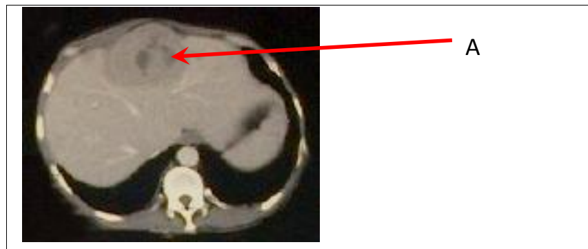
Figure 1: Computed tomography scan of the abdomen showing left liver mass (A) with areas of necrosis

Computed Tomography (CT) abdomen revealed heterogeneous liver mass measuring 7.01cm-AP, 8.50cm-Transverse, 6.30cm-Cranial-Caudal in the left liver lobe. Necrotic areas with no enhancement within the mass were noted (Figure 1). There were multiple ill-defined hypodense areas in the right liver lobe peripherally (Figure 2).